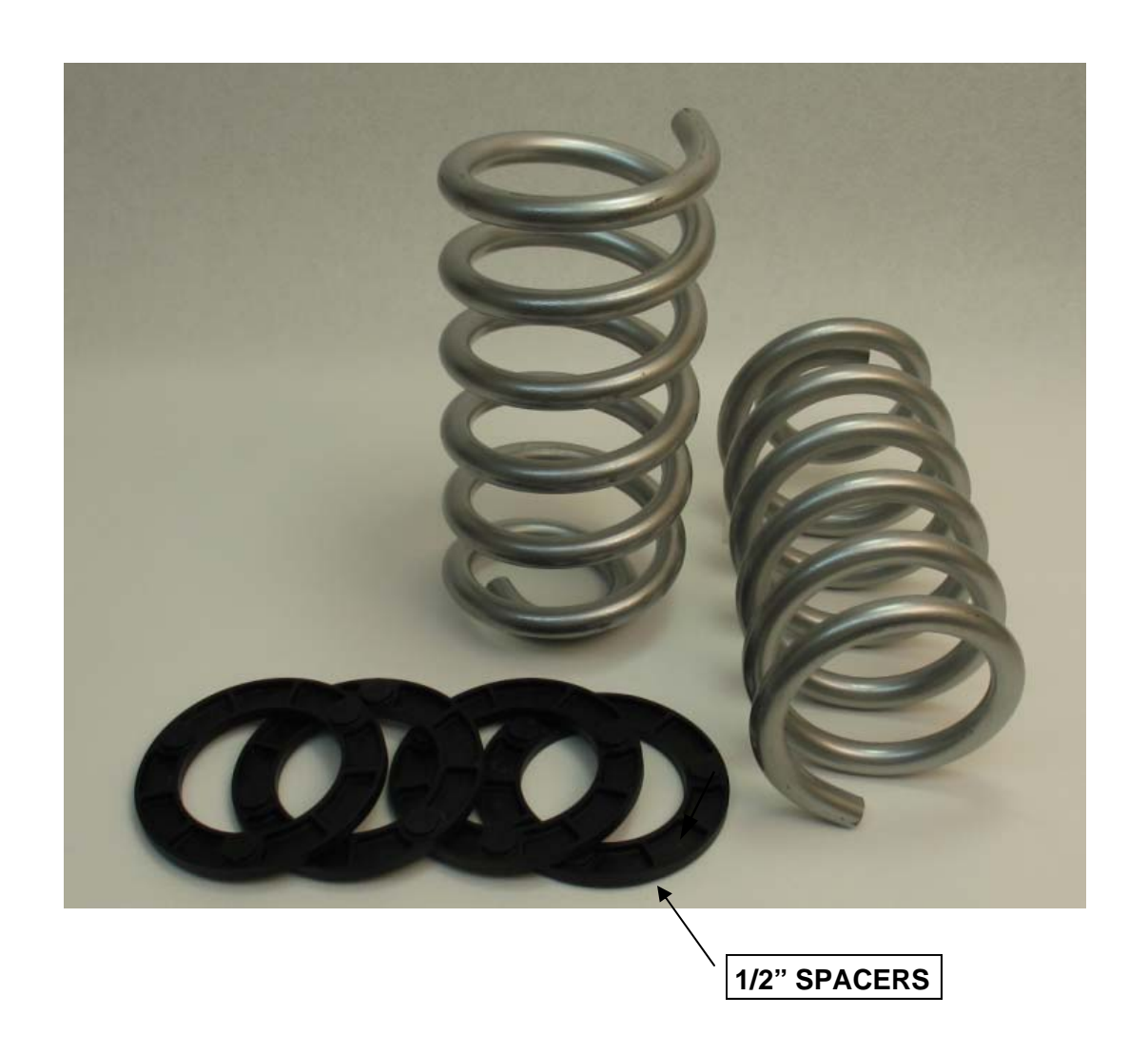
SHOWN IS KIT 12463/4 TWO(2) SPACERS = 1" IN HEIGHT FOR EACH SIDE