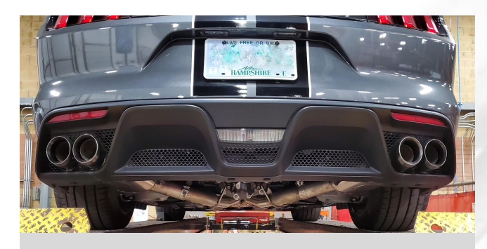
Detail 15: View from rear of vehicle