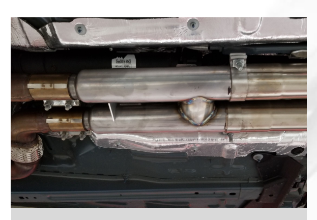
Detail 9: H-pipe and mid pipes installed (factory connect shown)