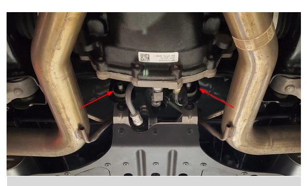
Detail 5: Rear subframe hangers