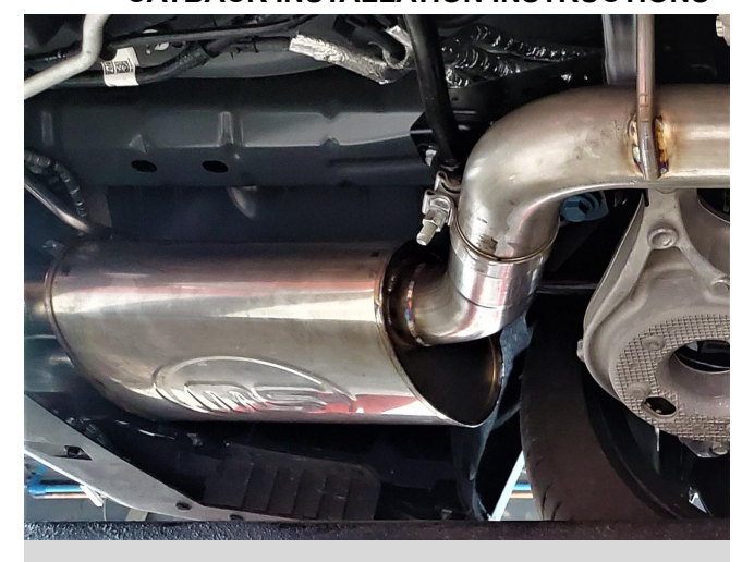
Detail 12a: Left muffler assembly installed