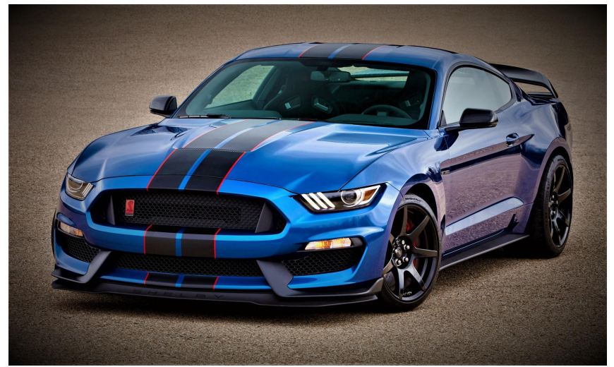
2019 Shelby GT350 5.2L GT350CB....

Thanks for purchasing a Stainless Works catback exhaust system for your 2015+ Shelby GT350 5.2L. Our team has worked to ensure that this product is premium in performance, quality, and fitment. We are proud to say that this system will unleash the true character of your vehicle. We encourage you to read through the following steps, and check the included Bill of Materials before beginning. Please follow these steps to ensure that your installation goes as planned.