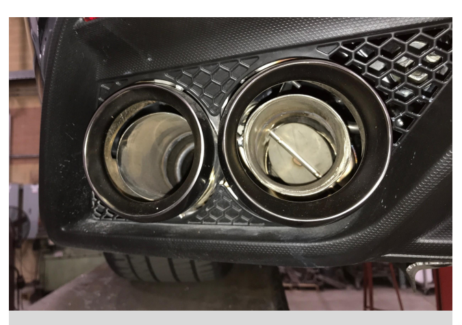
Detail 12b: Pipe alignment/clearance in OEM