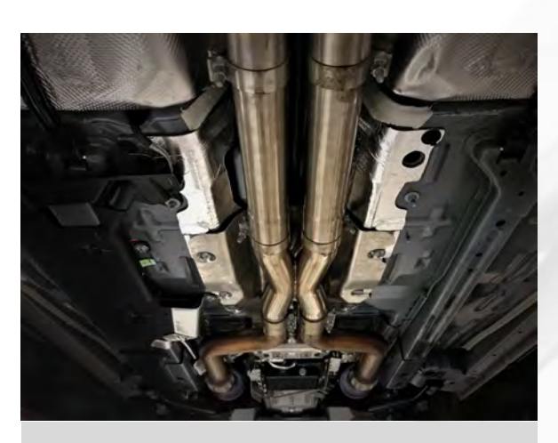
Detail 9: X-pipe and mid pipes installed (factory connect shown)