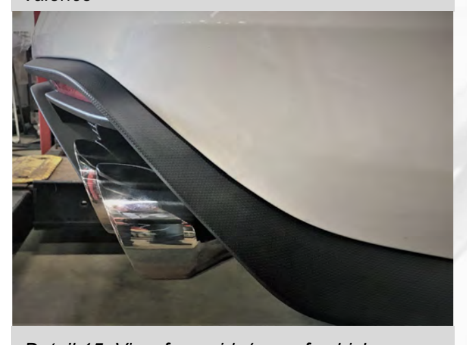
Detail 15: View from side/rear of vehicle