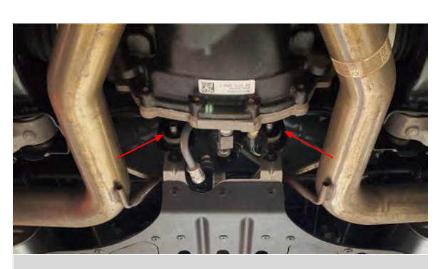
Detail 5: Rear subframe hangers