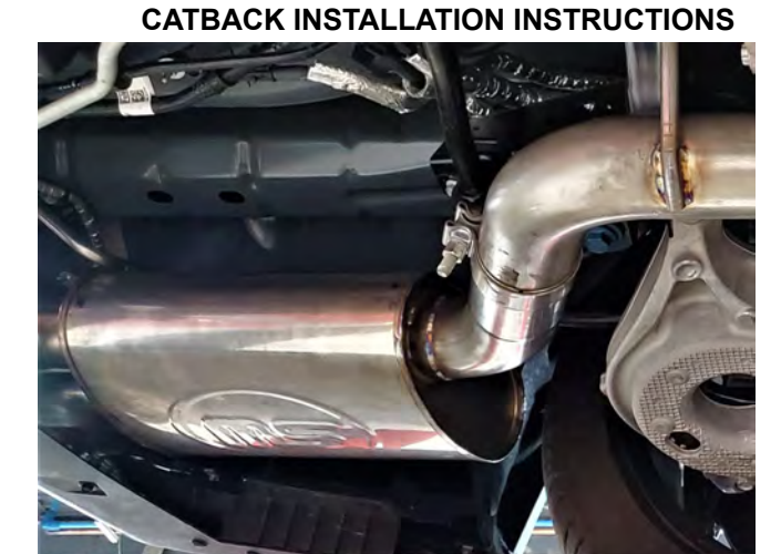
Detail 12a: Left muffler assembly installed