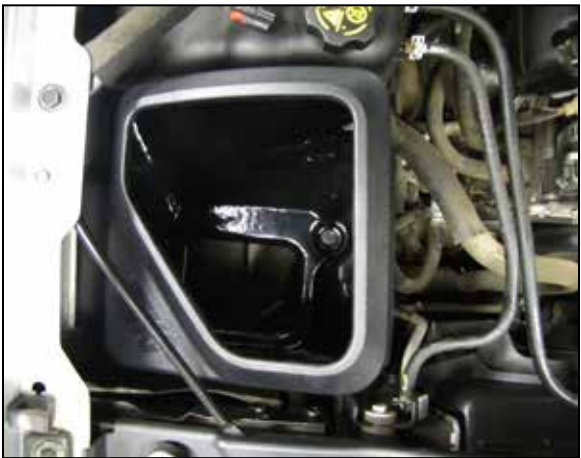
8. Install the K&N air filter housing so the fresh air intake passes through the opening in the inner fender and then secure to the inner fender with three factory bolts removed in the previous step.