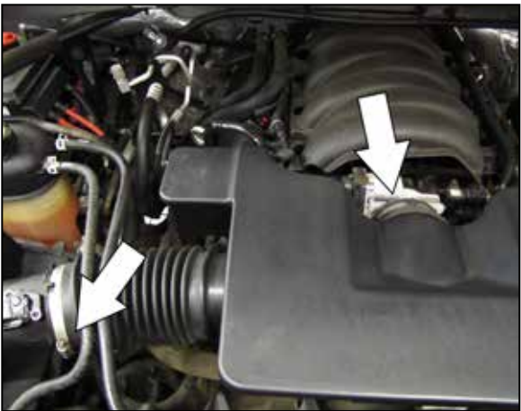
4. Loosen the hose clamps that secure the intake plenum to the throttle body and air filter housing.