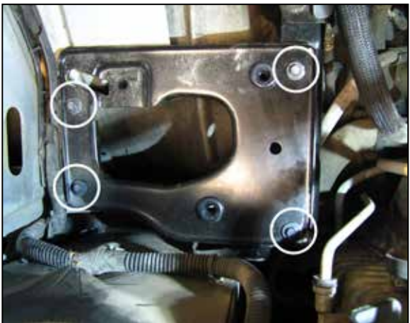
7. Remove the four bolts that secure the air filter housing mounting plate and then remove the plate from the vehicle. NOTE: Three of the bolts will be reused in the next step.