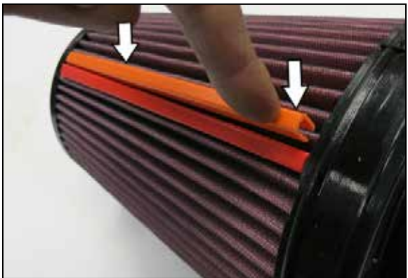
9. Attach the filter clips to the pleats on the air filter align and push down. Passenger side filters, place orange clip on top and red on bottom.