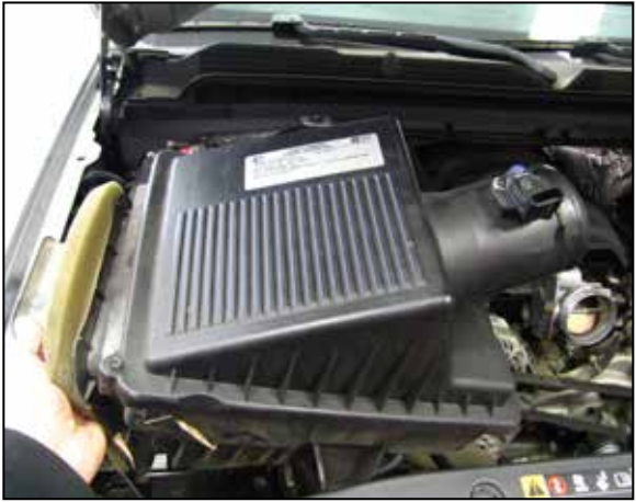
6. Lift the air filter housing up and then slide slightly to the right, then remove the housing from the vehicle.