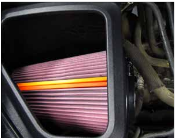
10. Install the K&N air filter into the K&N air filter housing.