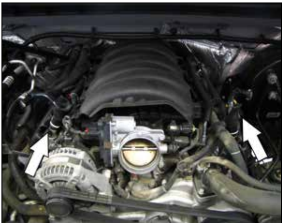
11. Depress the grey locking tabs and then remove the factory CCV hoses from the valve covers.