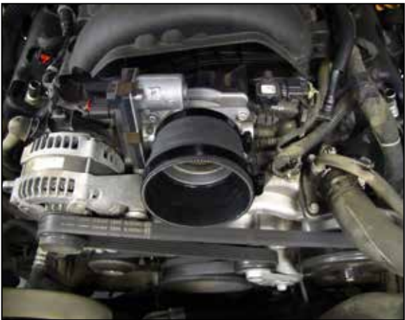
12. Install the step coupler (#08497) on 5.3L engines, hump coupler (#08418) on 6.2L engines and secure with the provided hose clamp. Tighten clamps using 5/16" socket or nut driver. Note: Do not over tighten clamps.