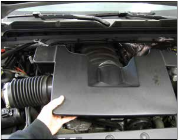
5. Disconnect the plenum from the air filter housing and throttle body and remove from the engine.