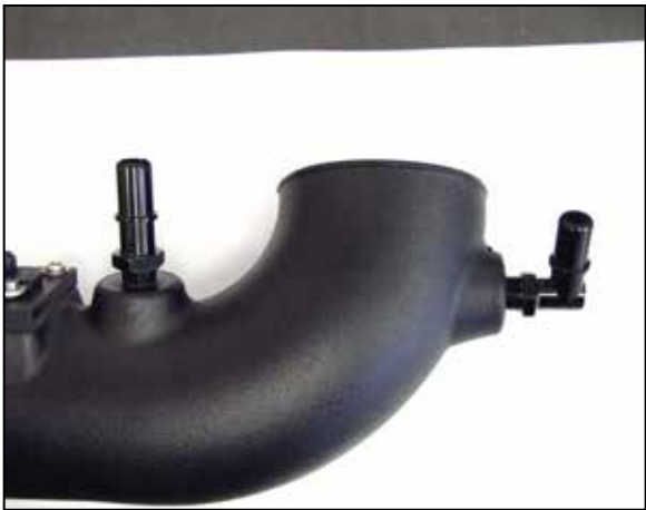
15. Install the provided CCV quick connect fittings into the K&N intake tube as shown. NOTE: the CCV fittings utilize 3/8npt threads, Hand tight the fittings and then use a wrench to tighten one revolution.