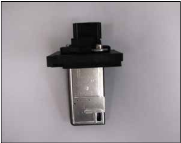
13. Remove the mass air sensor from the factory air filter housing and then install the sensor into the provided adapter using the provided bolts. Install the adapter gasket onto the bottom of the adapter.