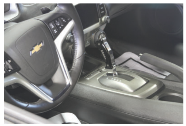
Congratulations, the installation of your Hurst Pistol Grip Shifter Handle is now complete!

5. Apply loctite to screw (2) then install it into front of shifter handle.