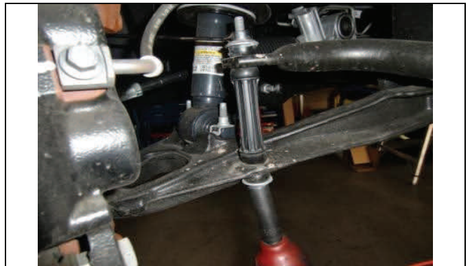
Disconnect dr/pass sway bar end links