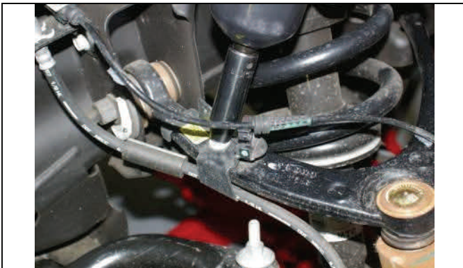
Disconnect ABS/brake bracket from upper control arm.