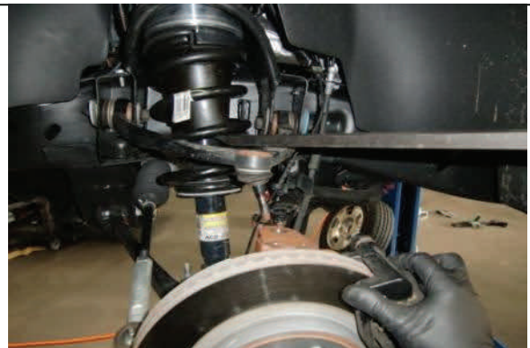
Lift suspension slightly while prying down to attach ball joint.