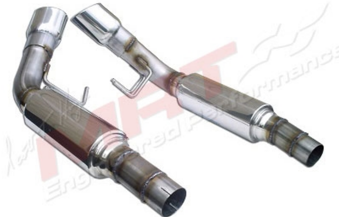
Part #1 – Driver Side Axle-Back

Verify that all of the following components are included in kit before beginning installation: