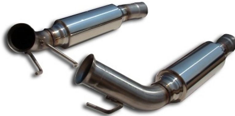
Part #1 – Driver Side Axle-Back

Verify that all of the following components are included in kit before beginning installation: