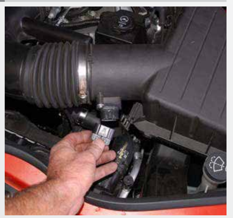
Disconnect Mass Air Sensor plug.