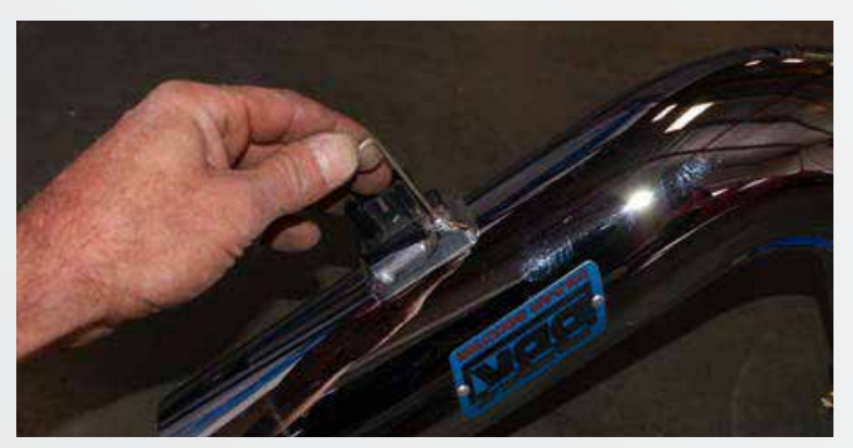
Install Mass Air sensor into the BBK inlet tube at the aluminum mount. Use the supplied Allen screws.