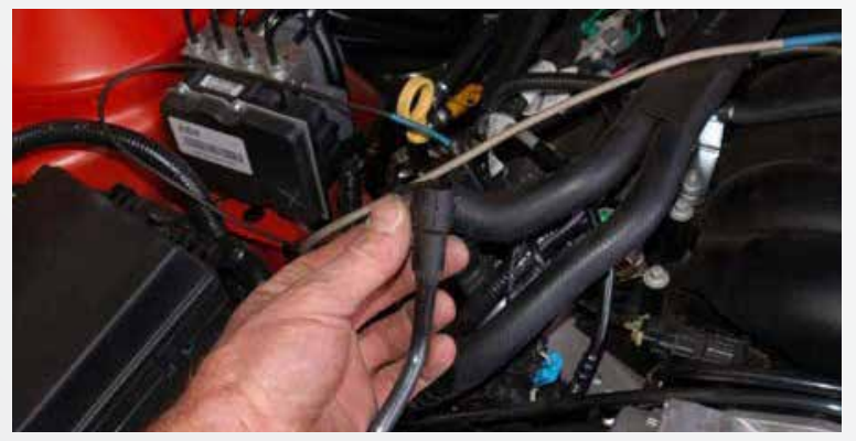
Loosen clamp on air inlet tube at throttle body. Disconnect plastic breather hose from tube at passenger side valve cover. Remove two nuts that secure the air box. Remove inlet tube and air box.