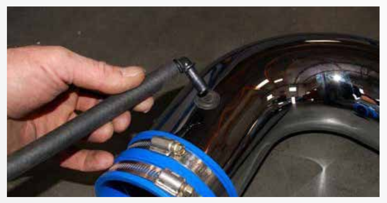
Install the supplied grommet in the bottom of the chrome inlet tube for the breather hose. Install the black plastic 90 degree fitting into the supplied 3/8" hose and push other end of Fitting into grommet. Install blue connector and clamps onto throttle body side of the tube.