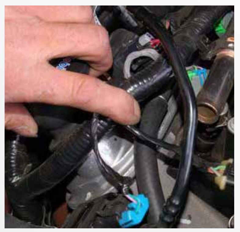
Route breather hose straight back under the throttle body and away from the idler pulley. Connect the hose to the steel breather line you disconnected the stock one from.