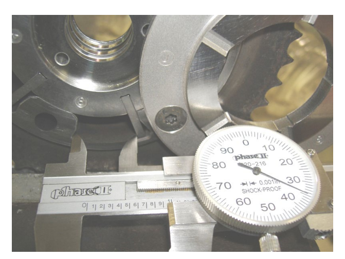
LT4 cam phasers have ~.935 in. chamber width (62 crank deg.)