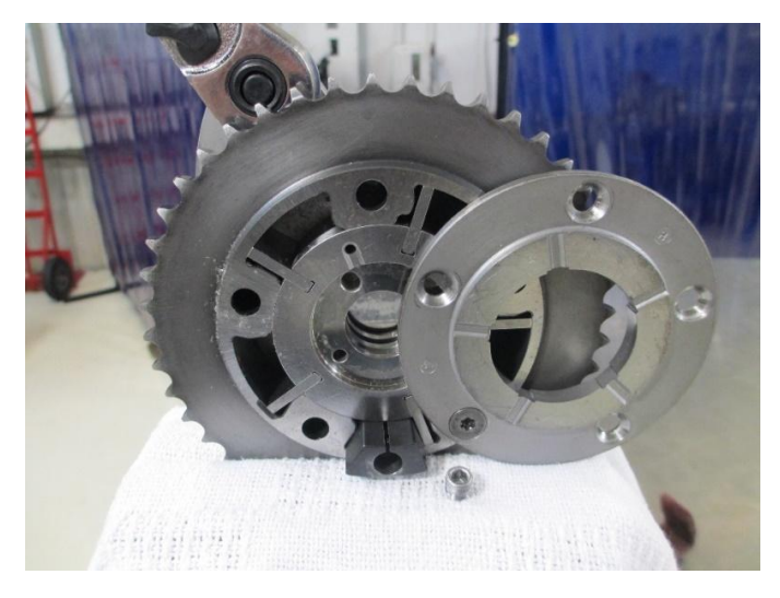
Step 8: Place anti-seize or high-pressure lubricant on the pipe plug, and thread the plug into the lock. Use your 5/32" Allen socket or wrench to tighten the plug until the lock does not move.