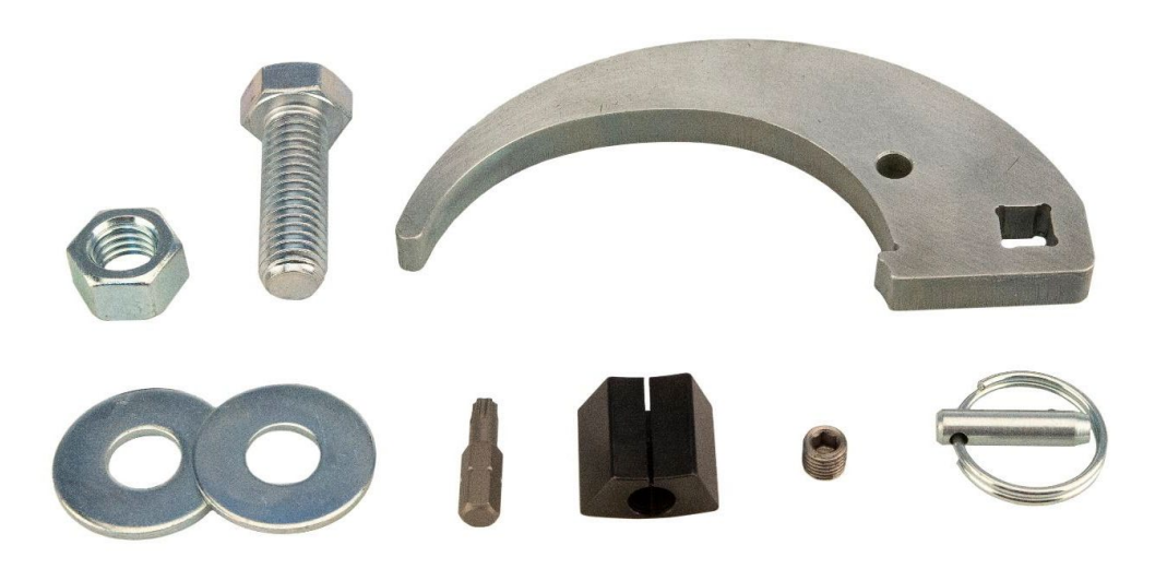
Kit #5471 only includes these listed and pictured parts