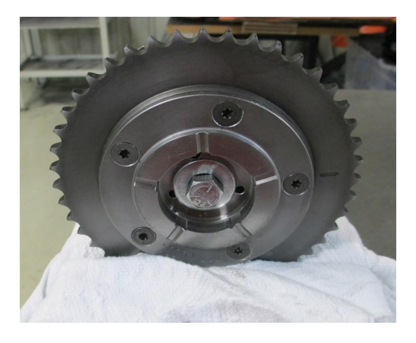
Step 10: Remove the cam phaser spring compression tool and the safety bolt assembly. The modified cam phaser is now ready for installation.