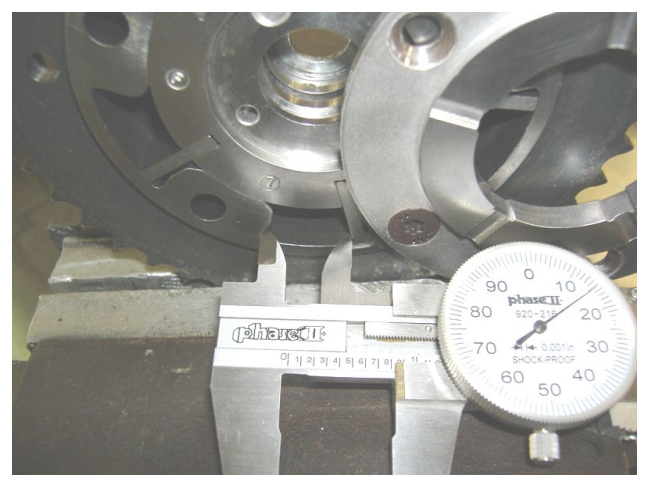
Other cam phasers have ~.815 in. chamber width (52 crank deg.)