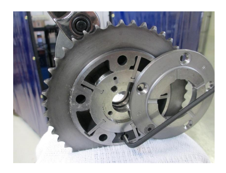
Step 9: Rotate the cover plate back over the control chambers and reinstall the safety bolt. Reinstall the cam phaser bolts, making sure to install the pin-bolt back into the correct position. Remember to torque the bolts to 85 in. lbs.