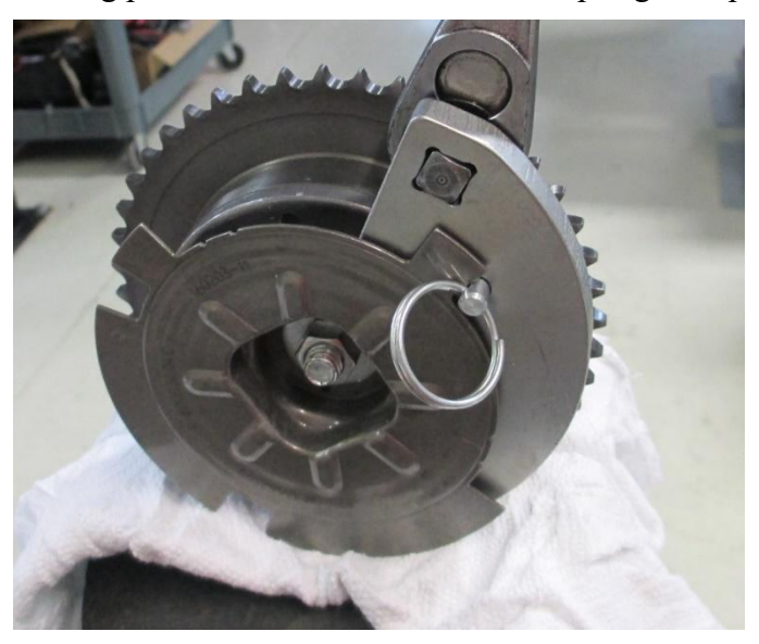
Step 6: Using the included TORX Plus bit, locate the pivot bolt and loosen it 1/2 turn. It is the first bolt located clockwise from the pin-bolt. Remember, DO NOT remove this bolt, just loosen it 1/2 turn. Remove the other four bolts and temporarily remove the safety bolt. Rotate the cover away to expose the phaser control chambers.