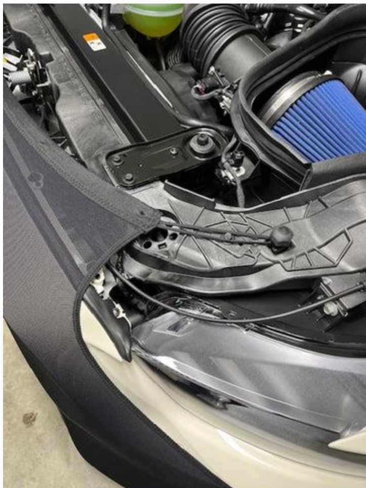
Radiator Shroud Post