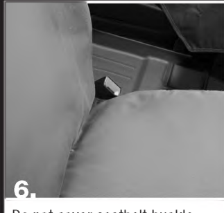
Do not cover seatbelt buckle.