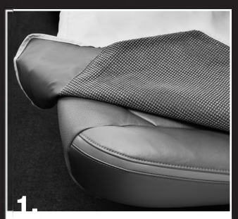
Unroll cover. Place seat bottom portion grippy side down and fold seat back portion over onto bottom portion. Ensure the half with straps is on top.

Thank you for purchasing the WeatherTech® Seat Protector for Bucket Seats. Please read this installation quide to thoroughly familiarize yourself with the steps to install the Seat Protector into your vehicle.