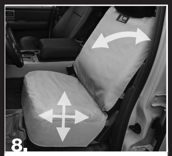
Please check your seat for full range of motion forward/ backward - particularly on vehicles with automatically retracting seats.