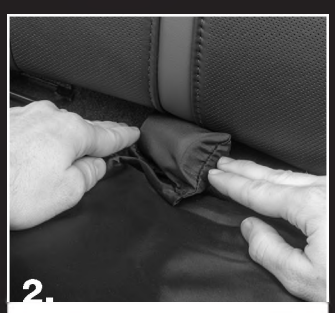
Insert foam attachment between seat cushion and seat back.