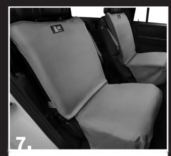
Finish installation by pulling the bottom portion of the Seat Protector around the seat bottom, draping it from the seat to the floor.