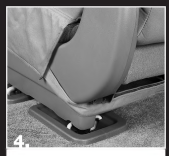
Attach hook & loop strap behind the lower part of the seat back.