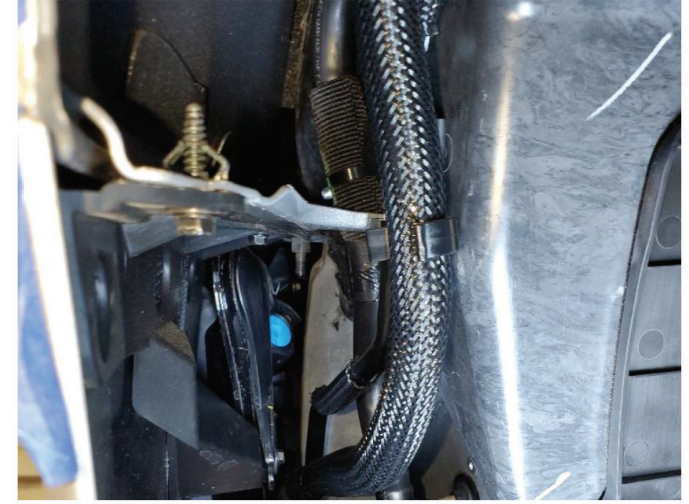
12. Repeat Removal Step 11 for the passenger side of the vehicle. Set aside the fasteners in a protected location.

11. The sides of the rear bumper cover are secured to the fender by a 10mm nut and two 7mm bolts on each side. Starting on the driver side, remove the nut first using a 10mm socket and 3/8" ratchet, followed by the two bolts using a 7mm socket and 1/4" ratchet.