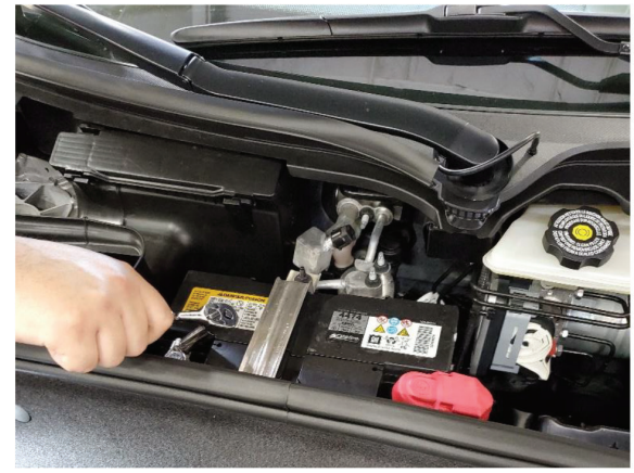
3. Disconnect the negative battery terminal using a 10mm socket and 3/8" ratchet.

Unclip the front trunk battery cover panel and remove from the vehicle. Set aside the panel in a protected location.