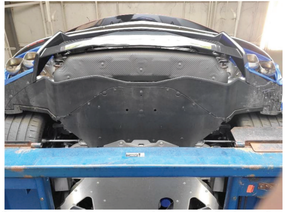
4. The rear bumper cover, two rear under trays, two inner fender liners, and the rear wheels will all need to be removed first in order to allow removal of the bumper cover