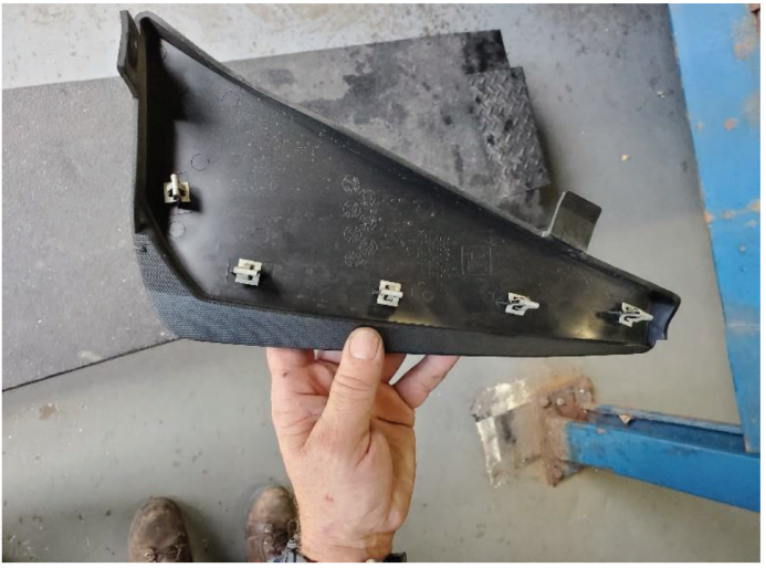
8. Unclip the two rear splash guard panels from the outside rearmost corners of the inner fender liners. Set aside the panels in a protected Location.

6. The rearward most rear under tray is secured by two push clips (1 per side), four T15 TORX screws (2 per side), and six 7mm bolts (3 per side). Remove the push clips first using a removal tool or flathead screwdriver, followed by the T15 TORX screws, and then the bolts using a 7mm socket and ¼" ratchet. This will free the rearward under tray from the vehicle. Set aside the rearward under tray and fasteners in a protected location.