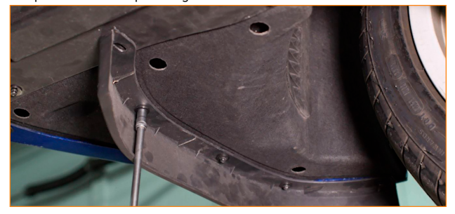
04. Remove the eight screws that secure the lower edge of the bumper. (8x 7mm screws)