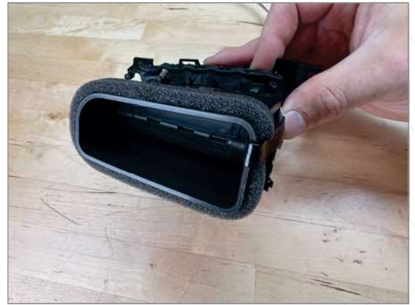
8 Close vent flap to hold cable in place. Pinch cable around back of vent as shown

WARRANTY & LIABILITY: Neither P3 Cars, nor its dealers or agents shall be liable in any way, for any damage, loss, injury or other claims, resulting from the installation or use of this product. By purchasing or installing this product, you assume all liability of any kind connected with the use and/or application of this product. If you are unsure that you can safely install and use this product, consult a qualified installer or mechanic. The warranty on this product covers only the product itself for a period of 6 months from the date of purchase, and it will be at our discretion to repair or replace the affected parts. No user serviceable parts inside. Warranty will be voided if product shows physical damage.