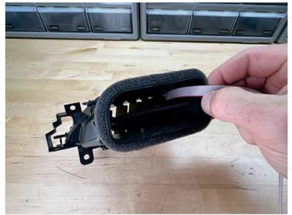
6b Make sure cable is flat against vent housing