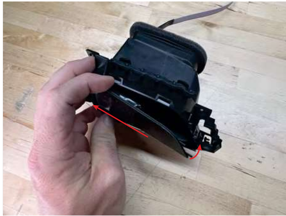
7 Install display by aligning left pegs with holes in vent then rotating right side of display into place