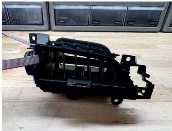
6a Feed ribbon cable through left side of vent with pink side on bottom

For additional install information please visit www.p3gauges.com/install