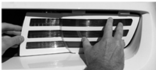
2) TIP THE TOP OF THE HEADLIGHT COVER BACK.