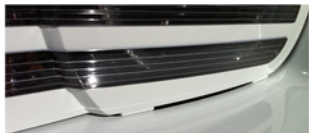
4) PROPERLY FIT BOTTOM TABS.