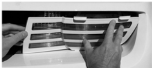
1) FIT BOTTOM TABS BETWEEN THE HEADLIGHT LENS, AND THE FACIA.

IMPORTANT: PRO CUSTOM PRODUCTS, INC. IS NOT RESPONSIBLE FOR IMPROPER INSTALLATION. IF YOU DO NOT FEEL 100% CONFIDENT INSTALLING THIS PRODUCT, SEEK PROFESSIONAL ASSISTANCE.