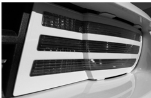
5) PROPERLY INSTALLED HIDEAWAY HEADLIGHT COVER. ENJOY!