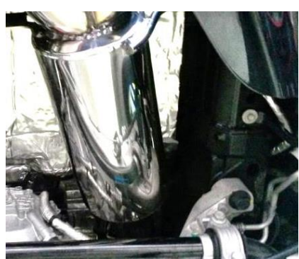
Figure 10 $7030 © 05/18

7. Unplug the motors that control the exhaust valves, some cars will have an additional set that operate valves for the outside tips. All cars will have the motors located just in front of the mufflers. Refer to Figures 6 & 7 .