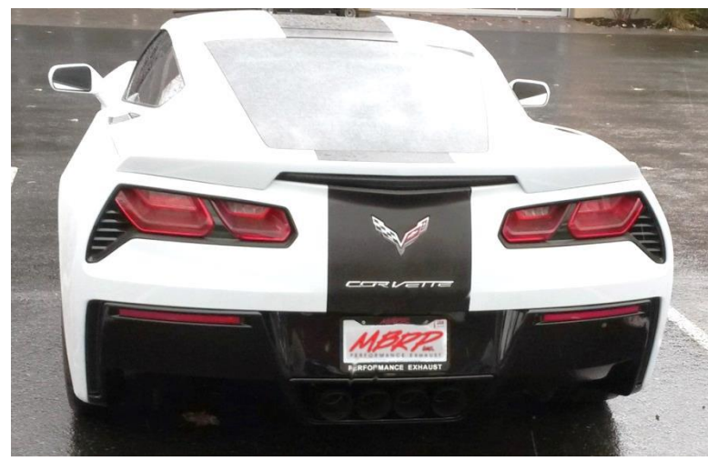
Congratulations! You are ready to begin experiencing the improved performance and driving pleasure of your MBRP Inc. performance exhaust system. We know you will enjoy your purchase.

6. Reinstall facia and check the alignment. Tighten all clamps and hardware. Check along the whole length of the new exhaust system to ensure that there is adequate clearance around the fascia, fuel and brake lines or any wiring. If any interference is detected relocate or adjust. Make sure you tighten all the bolts in the bumper facia. Reinstall the marker lights, grills & license plate.