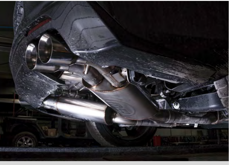
QUAD TIP - VALVES IN TIPS