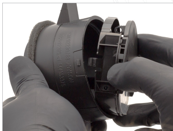
8b Install vent face back into vent housing. Be sure that detent pin stays in position.