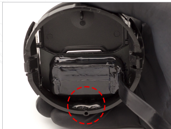
7 (optional) apply glue to bottom two tabs of the display