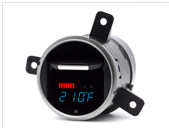
10 You are now ready to install your vent into your vehicle!