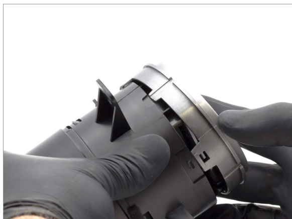
9 Reinstall trim ring onto vent housing.

Neither P3 Cars, nor its dealers or agents shall be liable in any way, for any damage, loss, injury or other claims, resulting from the installation or use of this product. By purchasing or installing this product, you assume all liability of any kind connected with the use and/or application of this product. If you are unsure that you can safely install and use this product, consult a qualified installer or mechanic. The warranty on this product covers only the product itself for a period of 6 months from the date of purchase, and it will be at our discretion to repair or replace the affected parts. No user serviceable parts inside. Warranty will be voided if product shows physical damage.