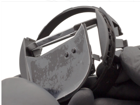
6 Install display into vent face.

Please download the latest copy of this document from www.p3cars.com/install