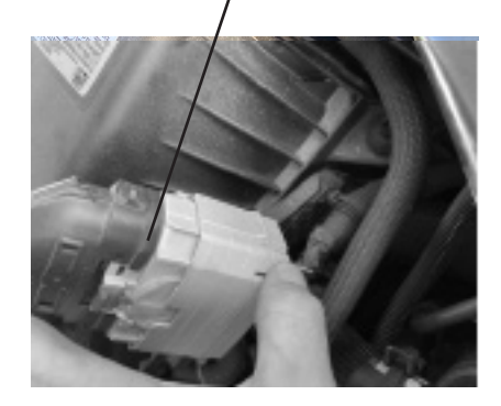
STEP 5 - Remove the zip tie tree from the bracket as seen below.