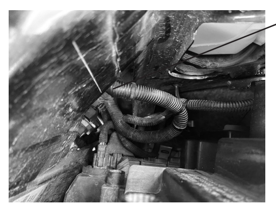
STEP 6 - Install the zip tie as shown on the left. It is located behind the driver side headlight.