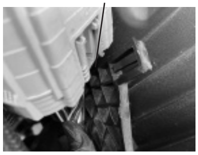
STEP 3 - Release red locking tab by pushing the red tab up as shown in the right.

STEP 2 - Release the locking tab in the back of the connector with a pick or small flathead screw driver as shown below.